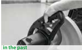
in the past

comfortable operation from all working positions